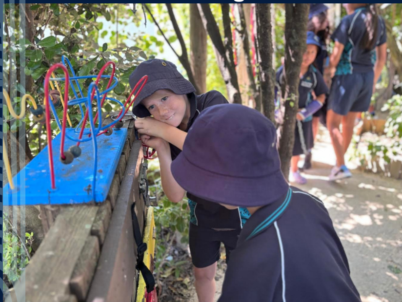
Henry Hill Sensory Garden Visit