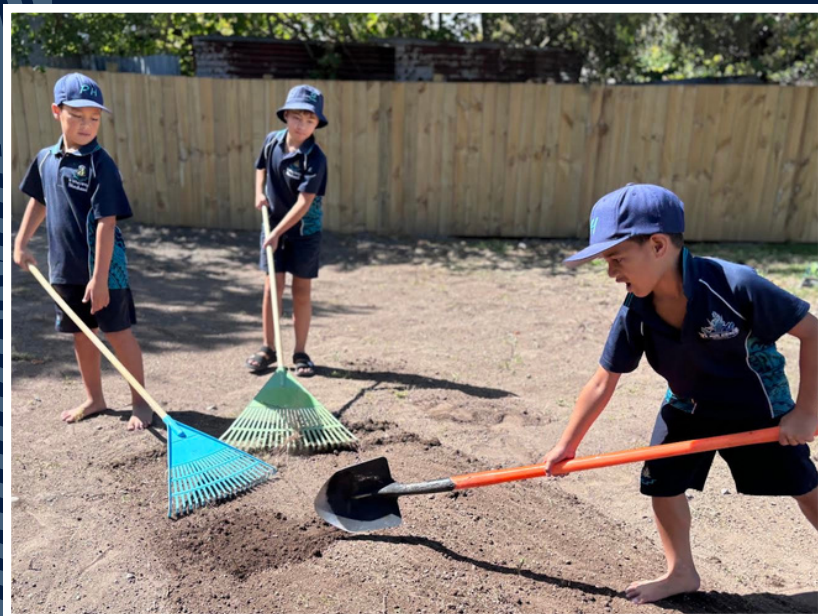
Sensory Garden Prep